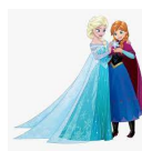
Elsa & Anna